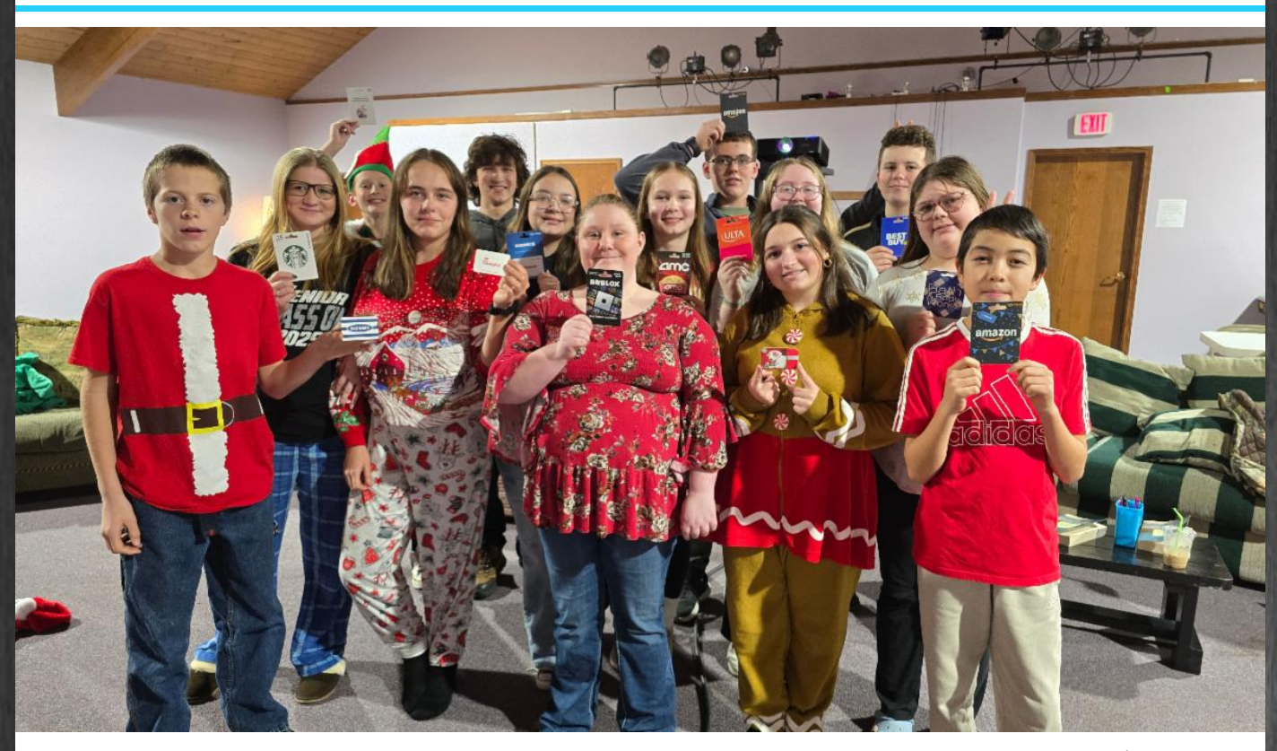
The youth would like to thank the generous members of the church that donated $25