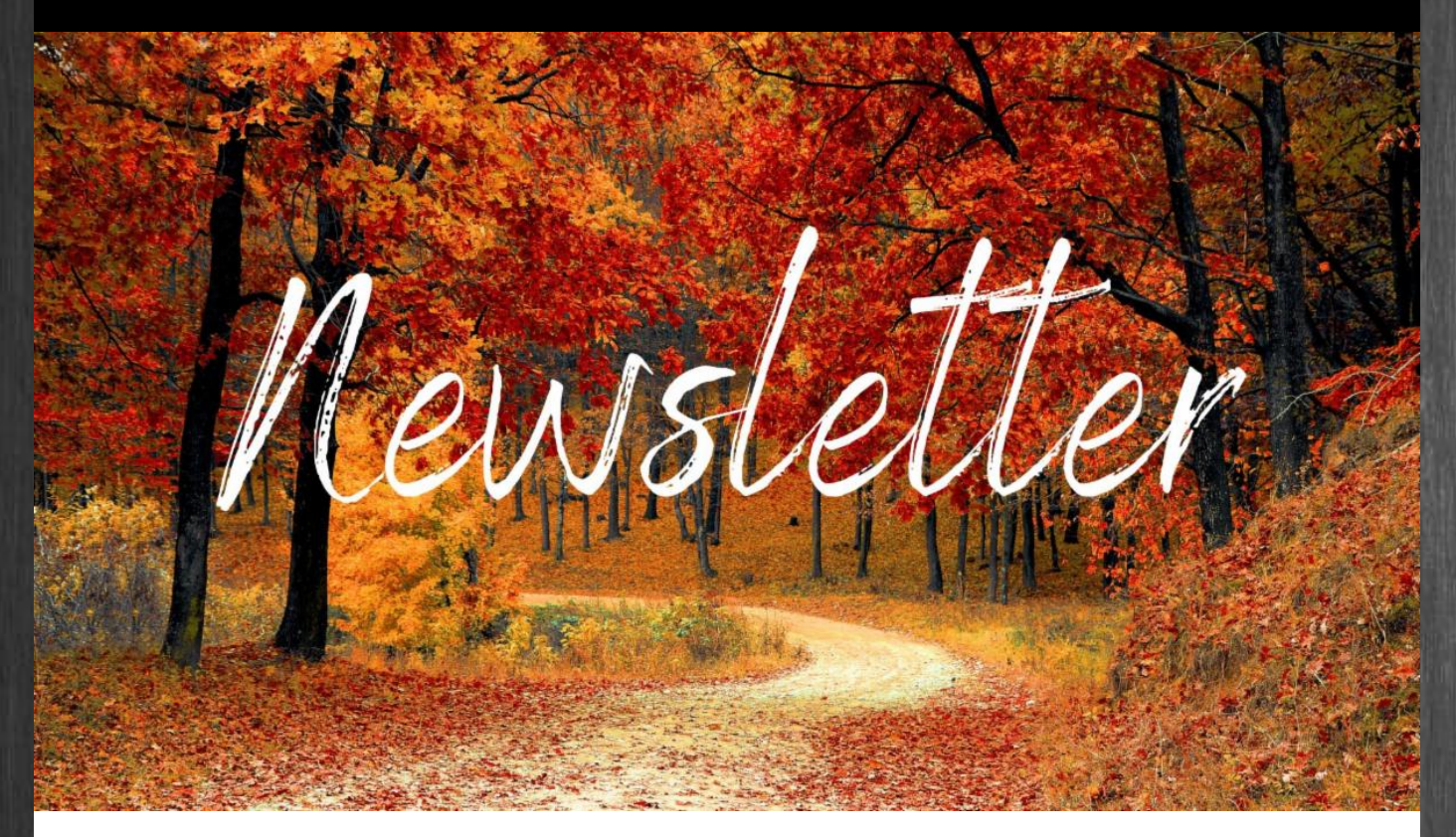
OCTOBER - 2024

I was reading a popular blog and the title wasSTOP NEEDING APPROVAL. START LIVING.