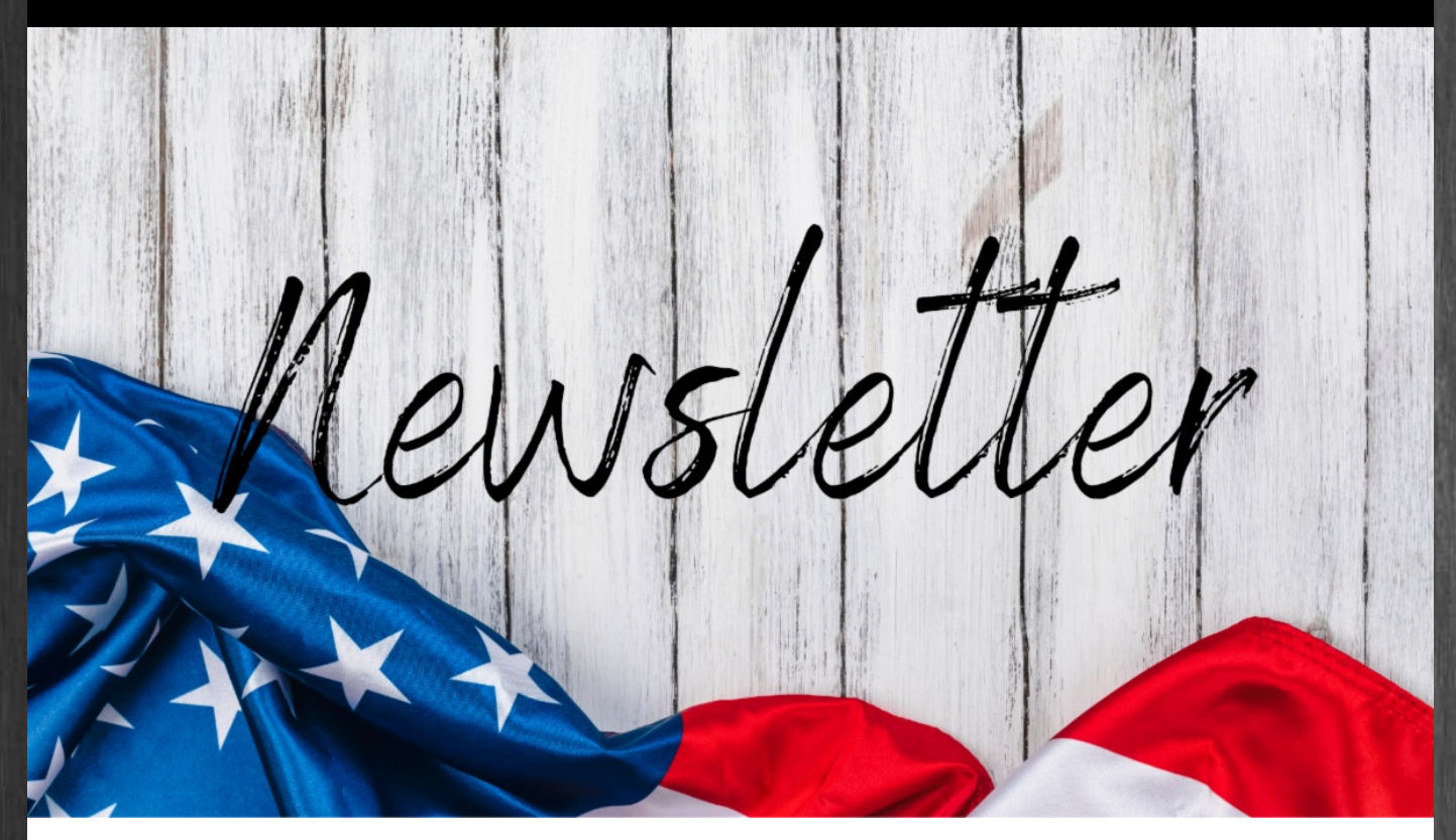
JULY - 2024