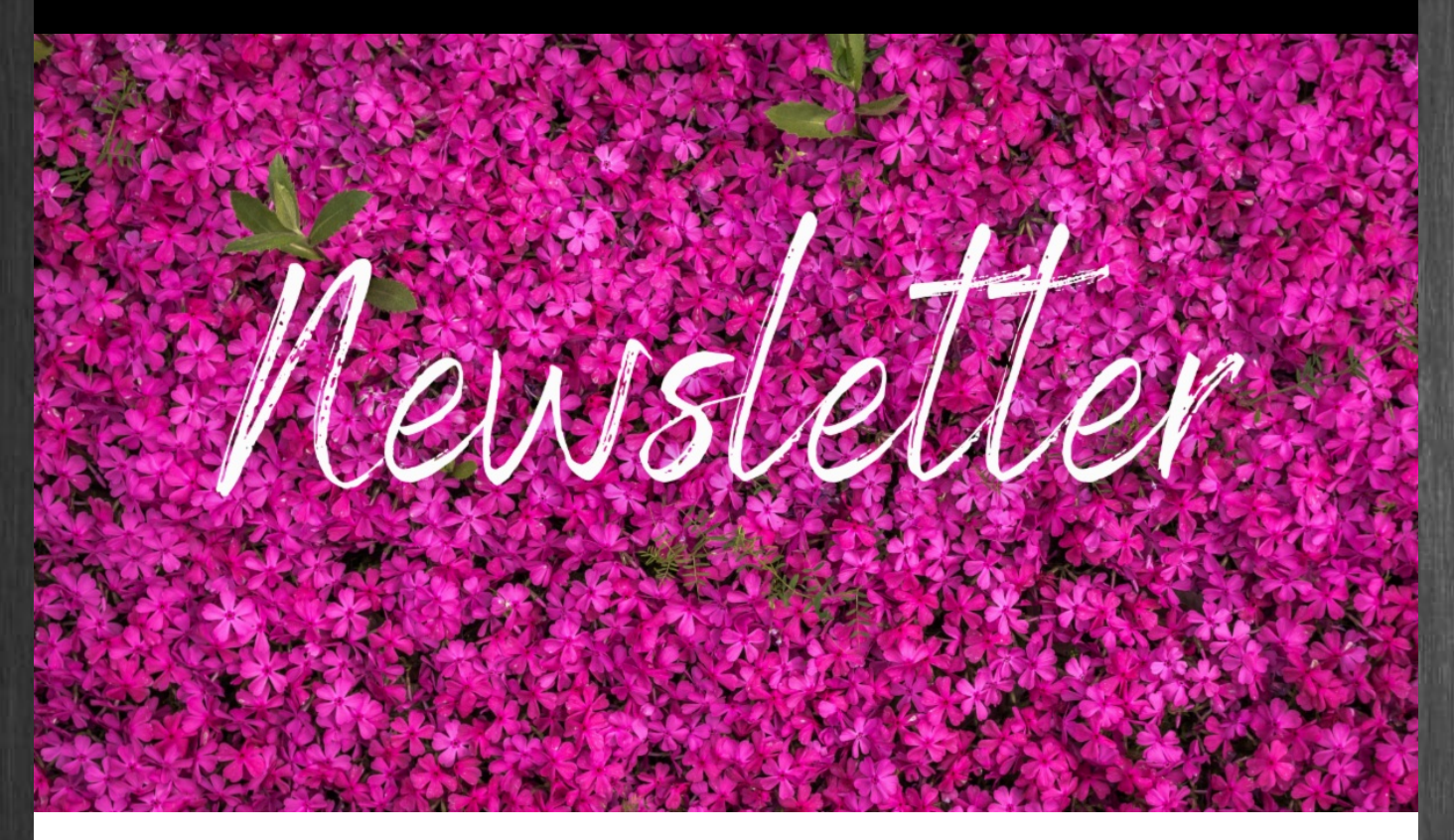
APRIL - 2024