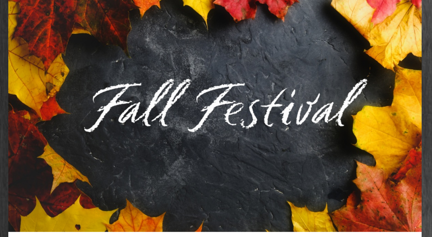
October 15, 2023

First Baptist Church will hold a Fall Festival featuring fun activities for all ages! There will also be live music. If you would like to perform, please contact George Killian. More info coming soon!