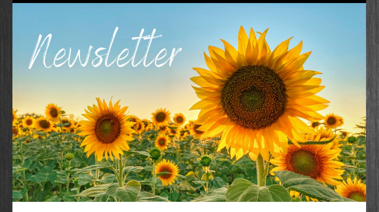
MAY - 2023