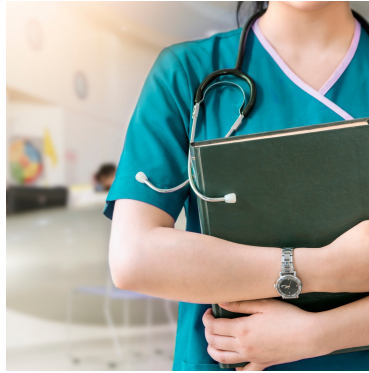
May 6-12 Nurses Appreciation Week