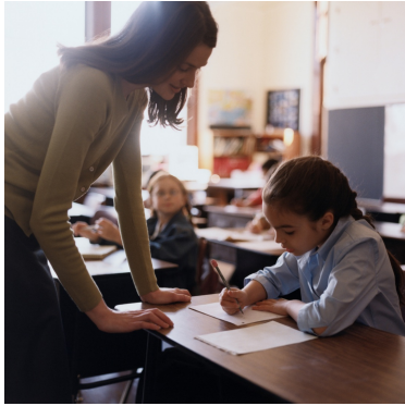
May 3-7 Teachers Appreciation Week

Mother's Day is May 9! Take time to show them how much they mean to you!