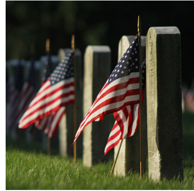
May 31 Memorial Day