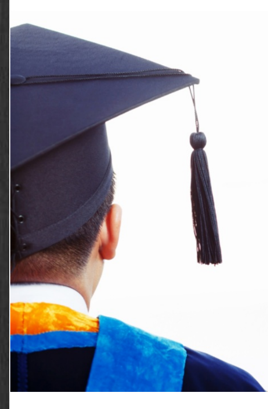
Graduate recognition Sunday is May 29th! All students graduating from high school,