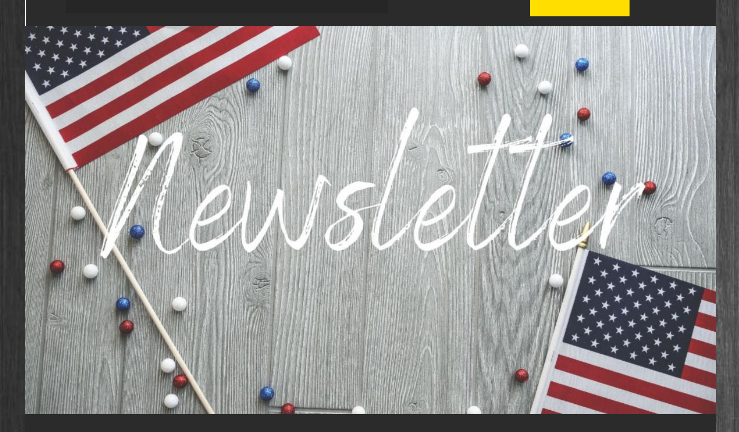
JULY - 2021