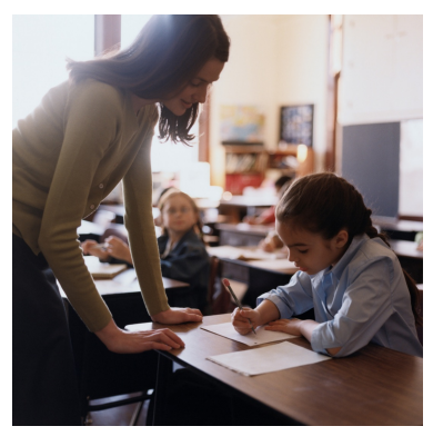
May 3-7 Teachers Appreciation Week