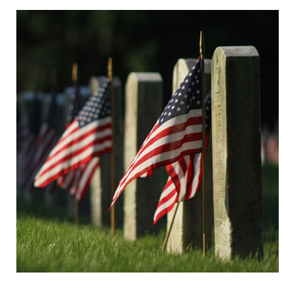
May 31 Memorial Day